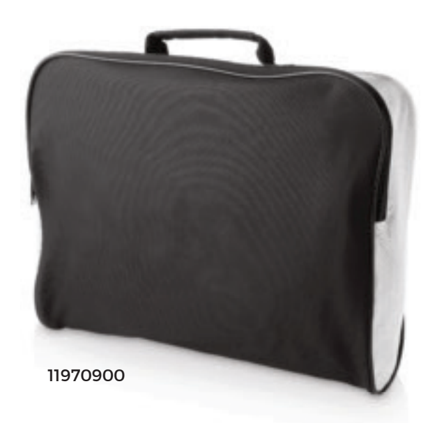
FLORIDA Conference Bag

Seminar bag with zipped main compartment. Bag fits A4 documents. 600D Polyester.